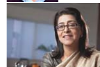
Naina Lal Kidwai, Immediate Past President