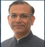
WINGS India 2018