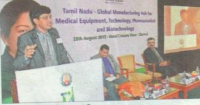
மேலதிக விவரம் கீழ்க்கண்ட செய்தியில் காண்க...