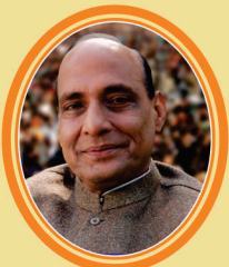
Mr. Rajnath Singh* Hon'ble Minister for Home Affairs Govt. of India