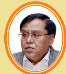
Dr. V. K. Saraswat Member NITI Aayog