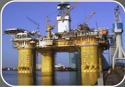
Oil and gas industries