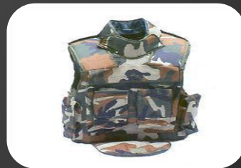
Bullet Proof Jacket