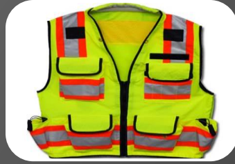
High- Vis Vest Jacket