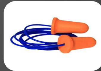
Earplugs and Muffs