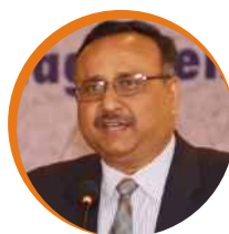
Sanjiv Mittal IAS Secy Finance Govt of Uttar Pradesh