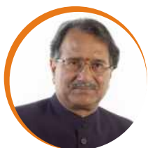
Rajesh Aggarwal Finance Minister Govt of Uttar Pradesh